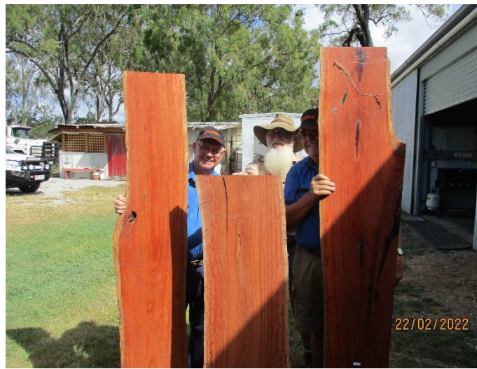
Image: Beautiful timber for sale

With a couple of new faces on the Management Committee, the Calliope River Men's Shed will get the new year rolling with a raffle of a Garden Seat made in the shed and can look forward to more timber sales with the arrival of the Lucas Mill.