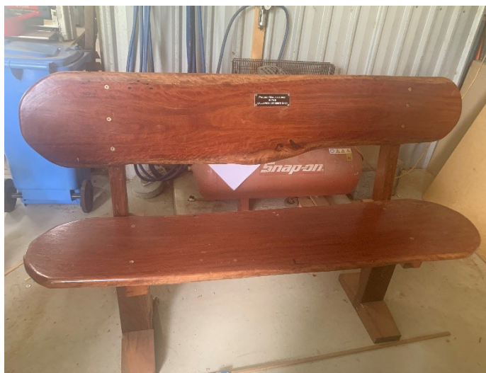
Image: Gorgeous handmade Garden Seat made in the shed

great relationship with the nearby Rio Tinto alumina refinery, and they have given us a Telehandler to recondition for our future use. The refurbishment of the Telehandler has provided an activity to the mechanics amongst us, and we are very close to seeing that running again. Coming up in April, Rio Tinto has invited us for a site tour and morning tea, which even sounds more attractive than playing